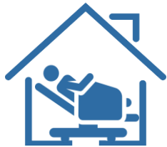
Isolation of Cases