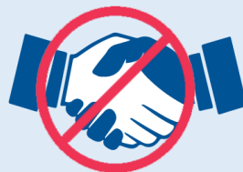
Avoid Shaking Hands