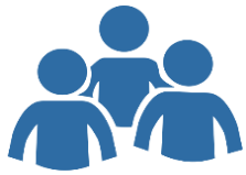
Person to Person