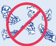
Avoid reuse of tissues