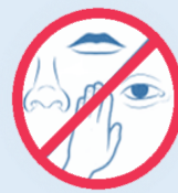
Avoid Touching your Eyes Nose or Mouth