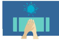
Droplets on Hands & Surface