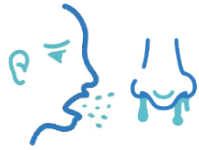
Inhaled Droplets from Coughing & Sneezing