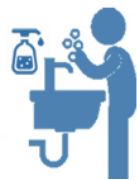
Wash Your Hands regularly With Soap & Water