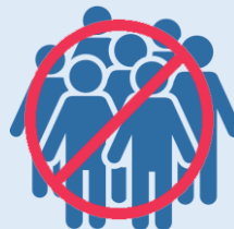
Avoid Crowded Places